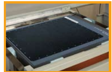
Retrofit Your Existing Equipment