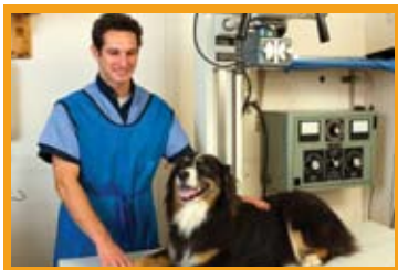
Reclaim Valuable Technician's Time