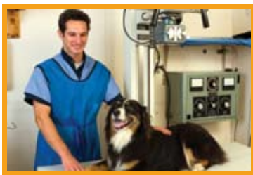
Reclaim Valuable Technician's Time