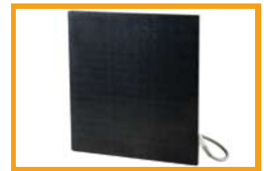
Panel Mounts into X-Ray Table